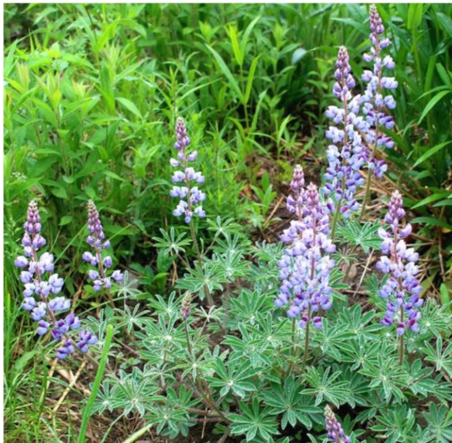
Native Sundial Lupine ( Lupinus perennis ).

At our October 2019 Bar Harbor Garden Club meeting, Michaelleen Ward and I proposed a new club project called "The Sundial Lupine Project" as a way to re-establish our club flower in Maine. This native plant ( Lupinus perennis ) is no longer found wild in the state, but has been re-introduced in the Wells area. Our hope is to increase its range in the state with the help of club members by planting seed in the fall in containers, then transplanting the new plants in the spring to pots which can then be donated to plant sales in the surrounding area. Unfortunately, the lupine that we see throughout our landscape is the non-native invasive lupine ( Lupinus polyphyllus ) and it does not serve as a host plant for the Karner Blue butterfly, which is now