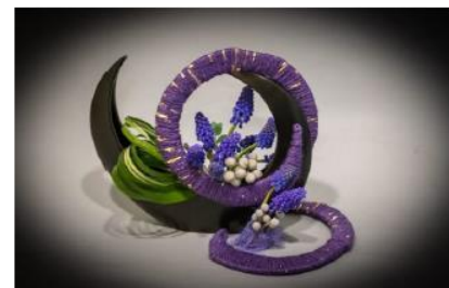
Candace Morgenstern "Freedom"