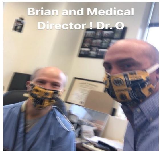
Doctors at Boston Medical Center wearing masks made from Boston Bruins fabric