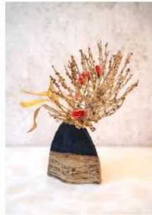
Raymonde Boisseranc "In Jail"