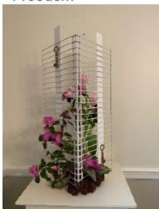
Blakely Szosz "In Jail"