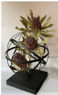
Tracey Banksia "Freedom"