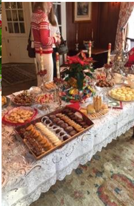
Members of the Garden Club of Manchester enjoy their Annual Christmas Tea in December!