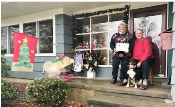
New England Garden Clubs