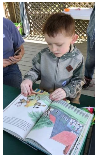
Time for a break and garden tips