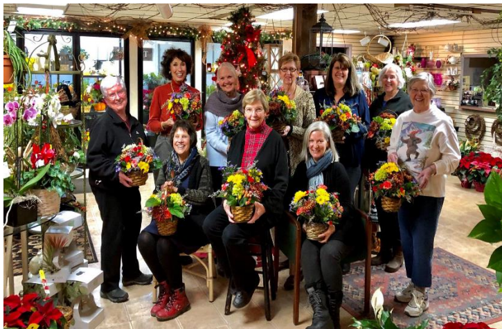
Photograph of several Burlington GC members at a floral arranging workshop before the holidays.