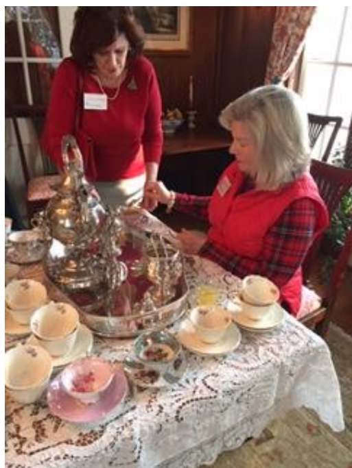
Middlebury Garden Club

members and nursing care residents working together.